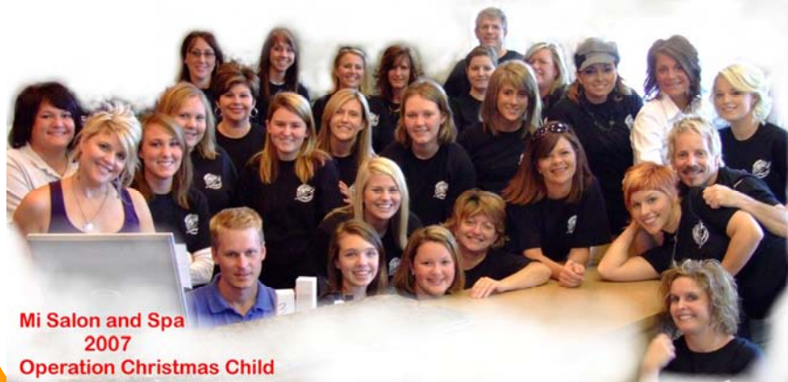
Mi Salon and Spa 2007 Operation Christmas Child

The staff of Mi salon Spa donated their time and services to support the cause. This is the third annual cut-a-thon held at Mi Salon Spa and they look forward to many more.