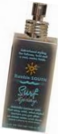
Bumble and Bumble "Surf Spray" for volumized beach hair, spray in at the pool to get volume and that beach tousled look - Josh