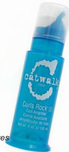
TIGI "Curis Rock" for natural curly hair - leaves curls soft, touchable with shiny definition - Marley