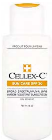
Cellex-C Sun Care SPF 30 A waterproof sun block for pro- tection from harmful UV rays. Perfect under makeup, great for all skin types and suitable for daily use - Ava, Sherry, Lexus, Lindsay & Debra