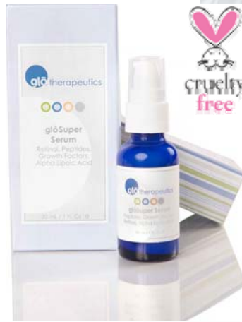
glo therapeutics Super Serum The ultimate anti-aging concentrate for all skin types and conditions - Ava, Lexus, Lindsay & Sherry