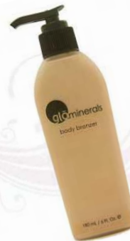
glo body bronzer to highlight tan skin and give you a beautiful "GLO" - Libby