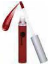
glo lip gloss for UV protection - Addison