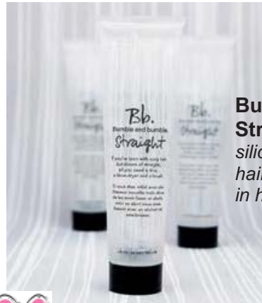
Bumble and Bumble Straight w/defrizz - silicone base prevents hair from curling back up in humidity - Brooklyn